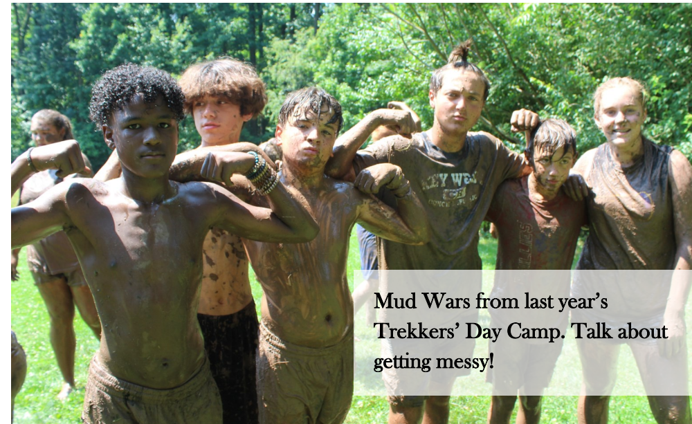
Mud Wars from last year's Trekkers' Day Camp. Talk about getting messy!